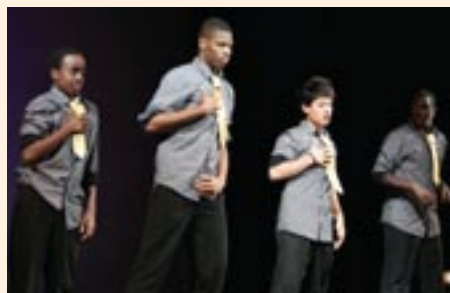
London Oratory School students

Following another successful year of the RAD and Jack Petchey Foundation's open access dance programme, Step into Dance students took to the stage of London's Mermaid Theatre on 11 July to share with friends and family just a sample of the dancing skills they have learnt this year. This year the project involved nearly 70 schools and 1,000 students, fulfilling the aims of the project to make dance more widely accessible. The project will expand into Bromley, Bexley and Barnet, reaching 100 schools and over 2,000 students.